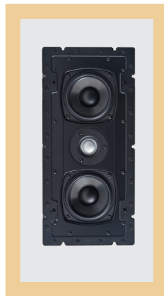
Model: KIN IW DIMS: 15.27 x 7.09 x 3.75 in

TRIBE-KIN PCB AIC - Pre Construction Bracket