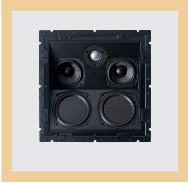
Model: KIN AIC DIMS: 14.09 x 14.09 x 4.72 in

Full back-boxed, high-performance In-Ceiling/In-Wall loudspeaker